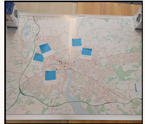
Notes from the Community Forum 2: mapping housing assets in Ipswich.

The launch of the project in Ipswich (CF1) saw 15 stakeholders in attendance, including community organisations, NGOs, local council, police and library representatives. To date, data has been gathered from two focus groups (CF2 and CF3) with local migrant, refugee and asylum seeker participants from Ukraine, Lithuania, India, Bangladesh, Syria, Afghanistan, Ghana and Turkey. Thanks to the community researchers, we have recorded 7 walking interviews with interviewees from Bangladesh, Lithuania, Syria and Afghanistan. All focus group and walking interview data is now being transcribed for analysis.